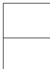
1/2 page JPY30,000