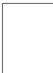
1 page with color JPY100,000